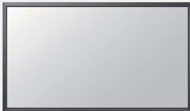
Figure 16. CY-PP40

If the surface of a display product is vandalized, users can simply replace the Protection Overlay, instead of incurring the expense of replacing the entire display unit.