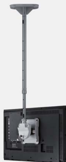
Figure 8. CML-400D

Samsung ceiling mounts enable display installation from the ceiling, on an extended pole that is adjustable in length to position the display at just the right height. The mounted displays can be adjusted in various vertical angles and the directional (horizontal) angle that the displays face can also be adjusted for optimal viewing. The ceiling mounts hold up to four times the weight of the supported display products.