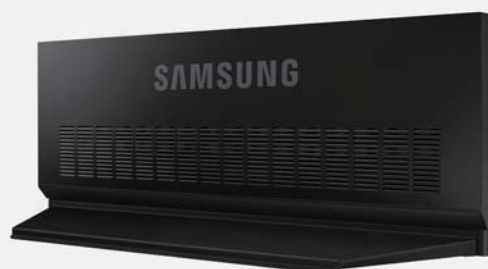
Figure 10. MID-UD55FS