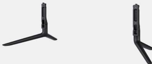
Figure 2. STN-L75E

The STN-L75E, STN-L3240E, STN-L4655E, STN-L6500E come as two separate stands that can be easily attached to the back of the display using the VESA mount holes. Each stand is designed with Y-shaped feet for convenient placement and stability. This stand also supports the use of an optional display touch overlay.