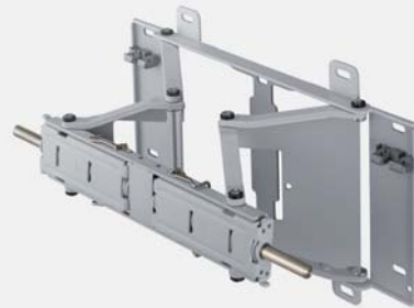
Figure 5. WMN-4270SD

The WMN-4070SD and WMN-4270SD are standalone-only wall mounts that once fully installed allows for not only variable depth by pulling the display in or out but swivel options as well. This enhanced flexibility provides the optimal viewing angle on a sturdy wall mount.