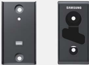
Figure 4. WMN350M

Ultra-slim WMN350M standalone wall mount offers minimal installation requirements due to its light weight, fixture and configuration. Varying depths can be implemented at the time of installation by using included brackets.