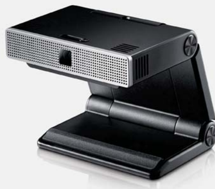
Figure 14. CY-SSC5000

The solution includes Dynamic Content Play feature which enables businesses to display targeted messaging on the SMART Signage to specific audiences. Plus, Data Statistics feature provides statistical data based on time and date along with age, gender and number of viewers.