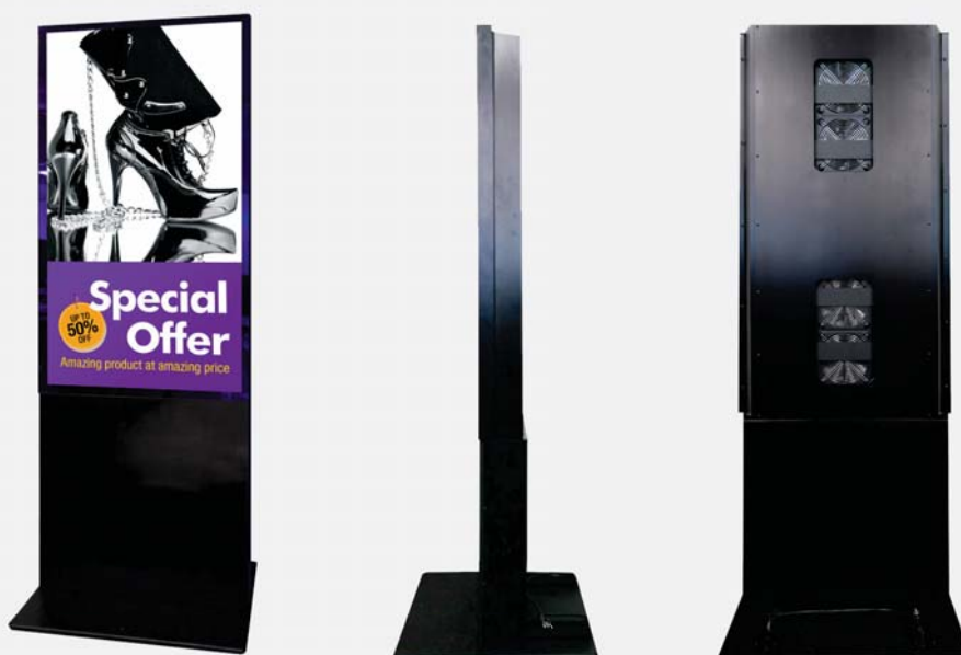
Figure 17. STN-E46D

OHD Series is conveniently and easily installed, designed and operated with a thin and complete all-in-one solution. The package includes ingress protection, anti-reflection technology, vandalism protection and a highly efficient cooling system, all of which are assembled mechanically and perfectly. The system revolutionizes outdoor signage design by eliminating the need for additional air conditioning systems and thick enclosures to accommodate the full display package. The simple OHD Series display enclosure requires no additional parts, so it is virtually simplest and thinnest outdoor signage enclosure in the market.