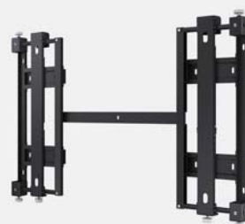
Figure 6. WMN-4675MD

The WMN-4675MD and WMN-9500SD are highly versatile wall mounts that provide not only solid support for standalone but video wall configurations. Its slim profile and post-installation cable inset capability deliver a clutter-free, ergonomic display area.