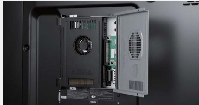
Figure 13. PIM-B

Plug-in-Module (PIM) adds performance to Samsung SMART Signage, with a Windows operating system (OS) for a familiar user interface (UI) and high compatibility with third-party software. PIM partially embeds on the back of the compatible Samsung SMART Signage to minimize bulk on the rear side, and reduces wire clutter. The product follows the OPS slot standard.