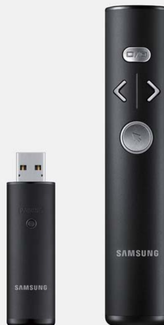
Figure 21. Magic Presenter

Samsung Magic Presenter enables presenters to point on screens including digital displays, while eliminating the risk of eye injury due to its laserless technology. With Magic Presenter a user can move about freely without worrying about it being blocked to provide a more dynamic presentation. Easily set up Magic Presenter by plugging the included dongle into smart signage or a PC USB port for immediate wireless use. And, users can customize the pointers shape, color, size and speed for more personal, intuitive experience for more focus on the presentation instead of controls.