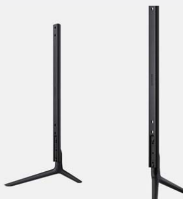
Figure 3. STN-L4655E