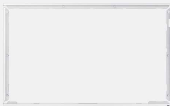
Figure 19. CY-BD40WD