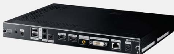
Figure 11. SBB-SS08E

transforms the common video walls using its powerful Quad Core CPU for faster information processing and easy-to-use content management performance with MagicInfo S3. The enhanced performance, flexibility and convenience of Samsung's Signage Player Box enable you to improve your information delivery and boost revenue with brilliant, large-scale digital signage – all in a cost-efficient manner.