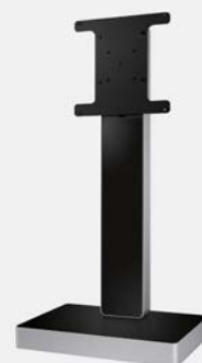
Figure 9. STN-W4075E