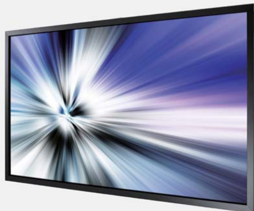
Figure 15. TM75LBC

For Samsung D-Series displays, most of the touch functionality can be achieved even without an SBB or PIM, however, an SBB or PIM can be added to bring out the capabilities of Samsung MagicIWB®.