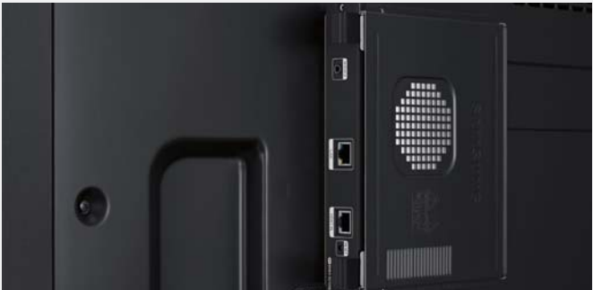
Figure 20. PIM-HDBT