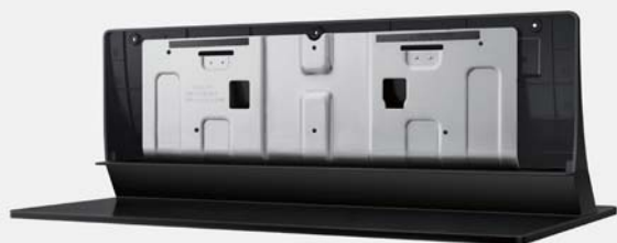
Figure 1. STN-L75D

The STN-L75D stand provides the most basic and simple way of standing up the display using a small but solid installation piece. In addition, the stand can support the use of optional touch overlay with the display.