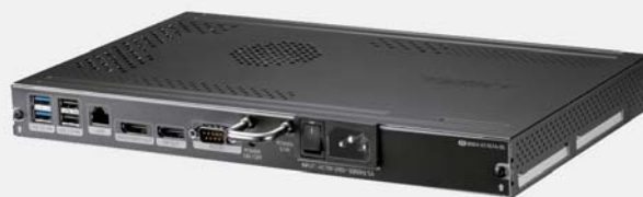
Figure 12. SBB-A

Set-Back-Box (SBB) is a lean, performance-focused upgrade that adds functionality to displays with minimal bulk and wiring clutter. The product easily installs in the back of Samsung SMART Signage, which is typically equipped with screw holes to fix the SBB in place. In addition, SBB offers performance ranges from dual core to quad core.