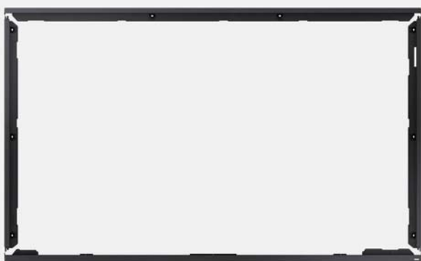
Figure 18. CY-BD40BD

Available exclusively for Samsung D-series displays, Color Bezel allows the displays to take on a different ambience to suit the customer's preference or the environment. Color Bezel is available in a variety of hues for customized expression.