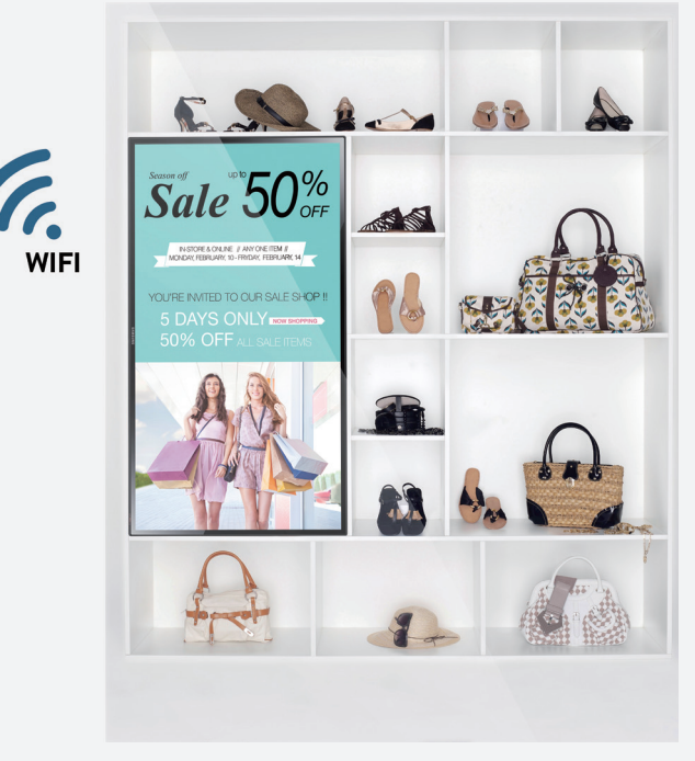
Figure 2. Wi-Fi connectivity

The built-in Wi-Fi module extends the DMD Series displays' connectivity and control, enabling the transferring, playing, sharing and scheduling of content to the video wall or a standalone DMD Series display without physical cables between content source device and the display. This feature eliminates the need for searching the back of the display to find the right connector port and the need for extensive lengths of cable dangling outside the display unit. The feature also allows custom mobile apps to communicate directly with DMDs; for example, the built-in Wi-Fi module offers screen sharing from note PCs, tablets and smartphones.